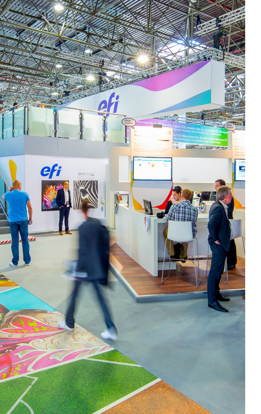
Exhibit days questions